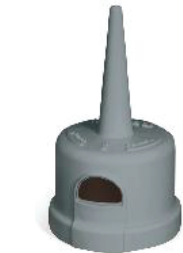
Wireless Controller Lite