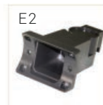
For large size round pole