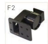
For wall mounts