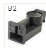
For small size square pole