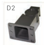
For large size square pole