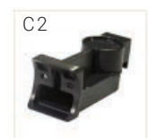
For small size round pole