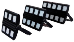
675 Series: 400W, 600W